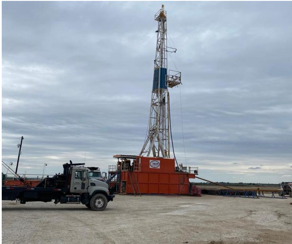
Figure 1: Varn Oil Field - Drilling of JVU#6